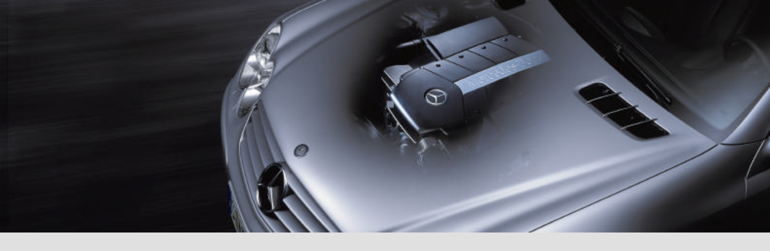
Factory Approved Service Products June 2002