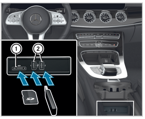
Connecting external media sources

MARNING Make sure that you read the entire Operator's Manual. Otherwise, you may not recognize dangers.